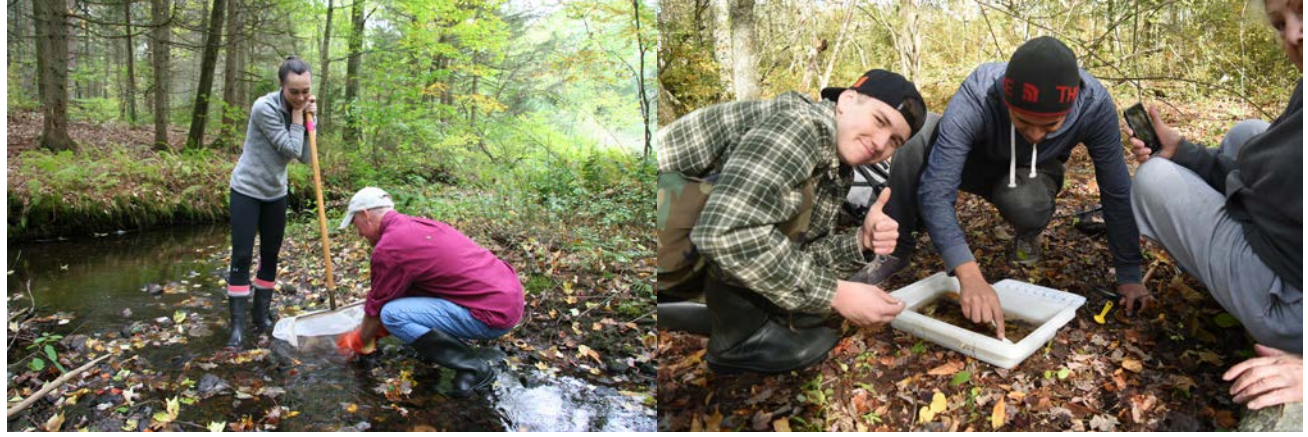
Above Left: Volunteers with the Vernon Conservation Commission's Local RBV program monitor Rickenback Brook in Vernon, CT; Above Right: Three Rivers Community College students sort a sample from Ransom Brook.

Appendix B: RBV Monitoring Station Descriptions and Details