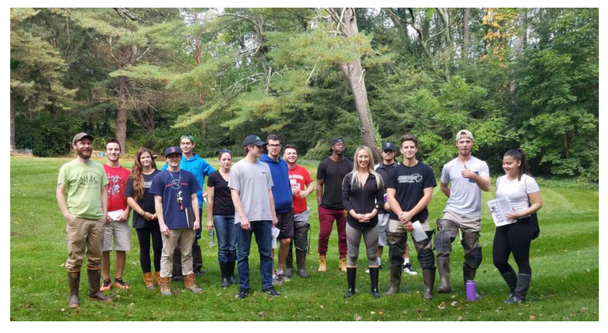
Nichols College students participated in the Last Green Valley Association's local RBV Program in 2017.

2018 marked the 20<sup>th</sup> anniversary of the Riffle Bioassessment by Volunteers (RBV) program. Over the past two decades hundreds if not thousands of RBV volunteers have participated in the program. Our program would not be possible without the volunteers that actually head out into the streams each year to collect RBV samples – thank you to each of you!