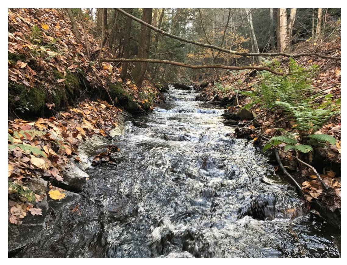
Above: Railroad Brook in Bolton, CT.

If volunteers can find four or more pollution sensitive or 'most wanted' macroinvertebrates, CT DEEP can use this data to assess that stream as fully supporting water quality standards for aquatic life use – documenting it as one of CT's healthiest streams! (Because it is a screening approach and not a more in-depth assessment methodology, RBV cannot provide a detailed water quality assessment nor can it be used to identify low or impaired water quality.)